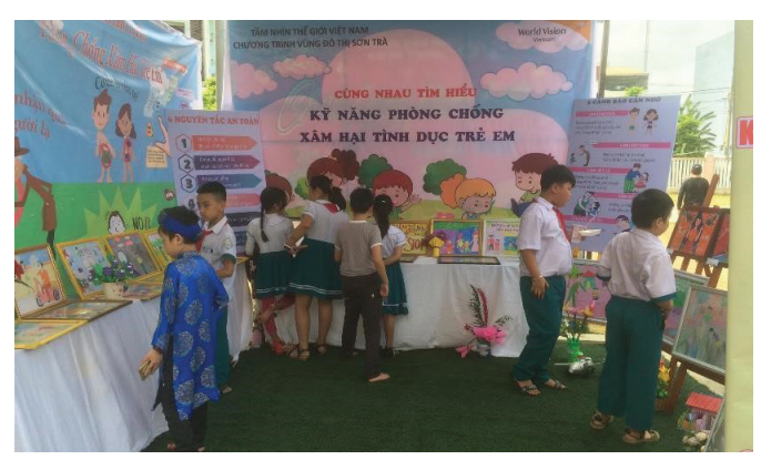
Children participate in awareness campaigns on how to stay safe from sexual abuse and other child protection issues.