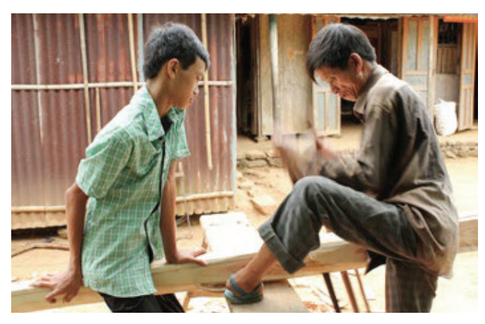
Skills training is provided for youth.