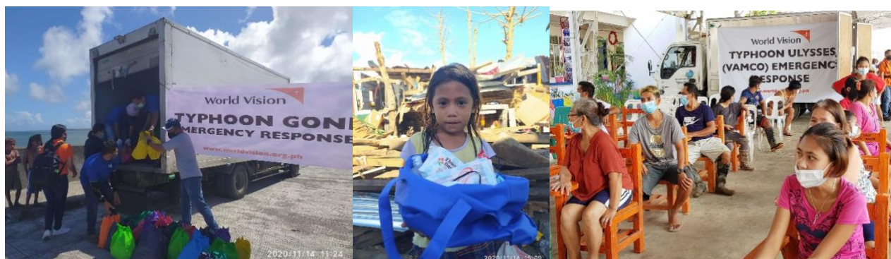
Families affected by the typhoons in the Philippines receiving emergency aid amidst COVID-19 safety precautions.