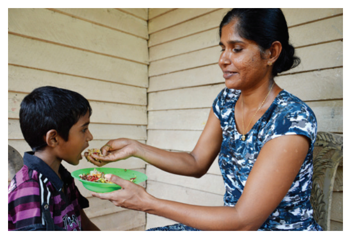
Rehabilitation is provided for malnourished children.

To decrease the high dropout rate and boost literacy among children and youths, World Vision promotes good governance in school systems through strengthening School Management Committees. Training for teachers and peer-based learning activities are conducted to improve access to quality teaching and learning opportunities. In addition, child-friendly learning environments are enhanced through renovations and construction.