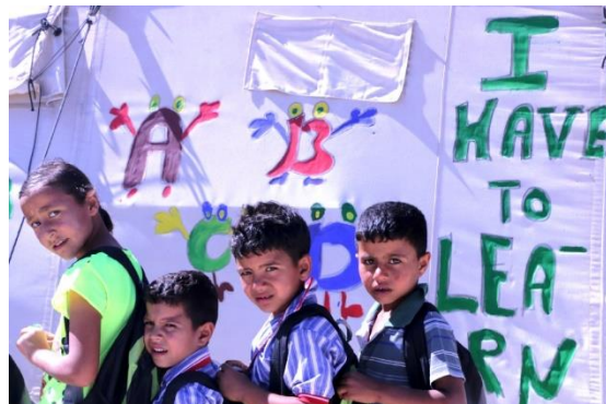
"I Have to Learn"

The war in Syria was just an obstacle in the academic path of this group of Syrian refugee children who strongly believes that they have to learn. With the help of their parents, they are now pursuing their education in World Vision's Early Childhood Education (ECE) centres in Lebanon.