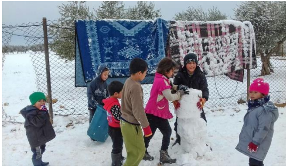
World Vision staff distributes blankets to communities at A'zaz Camp near Aleppo. Heaters and fuel were also distributed to households to prepare for the coming winter