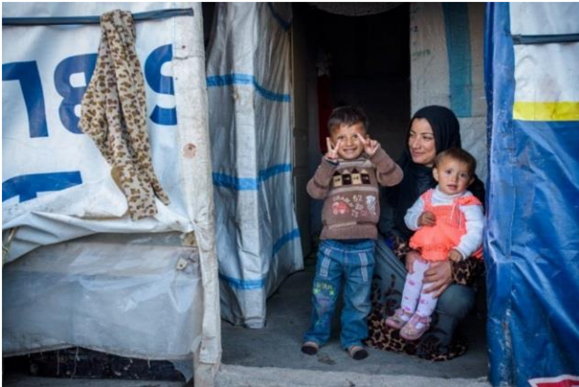
Syrian refugee-children who are now benefitting from World Vision's interventions in the Middle East

Now in its seventh year, the Syria Crisis shows no signs of abating and children are caught in the middle. Out of over 4.8 million registered refugees, over half are children.