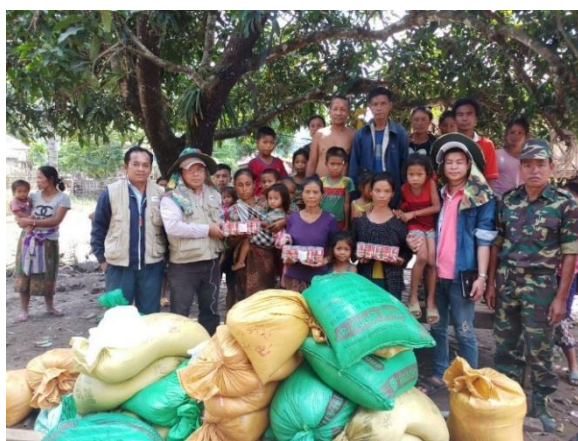
Children receiving hygiene kits in Attapeu (top); Families receiving rice and cans of fish in Khammoun (bottom)