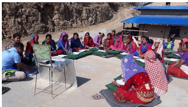
Community members at a Market Literacy Class