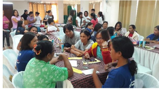
Adults participating in CoMSCA congress