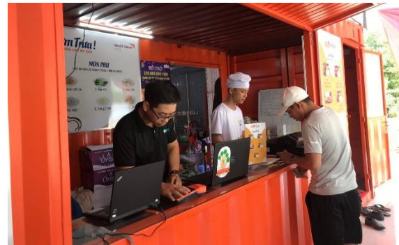
Youth who was supported with vocational training now employed and hopeful for the future