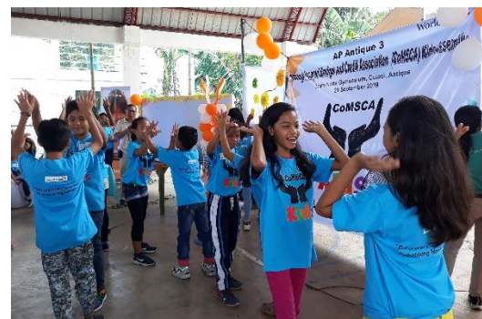
Children enjoy activities like dance and songs, writing contests and quizzes.