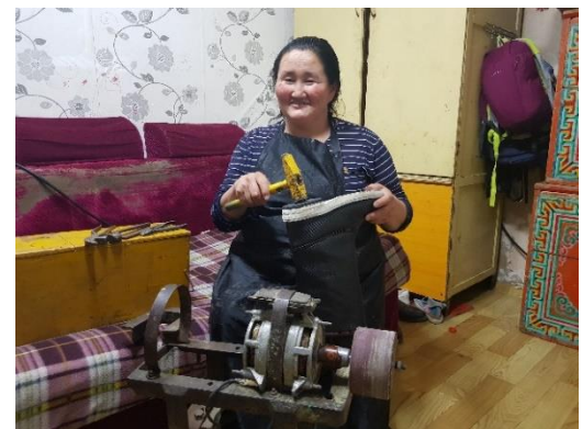
Beneficiaries of the Graduation Approach are exposed to alternative livelihoods (eg. shoe-making, etc) and can receive sponsored equipment in addition to the skills trainings