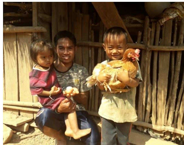
Supporting families in chicken farming, orchard and kitchen vegetable gardening for food and additional income