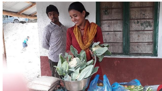
Producer group participant preparing her crops for sale