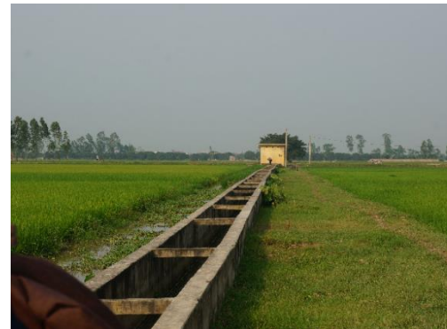
Irrigation systems to improve crop productivity