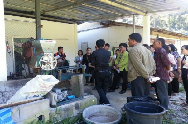
Farmers on an agriculture study tour which helps them to improve their knowledge and farming methods for higher agricultural productivity