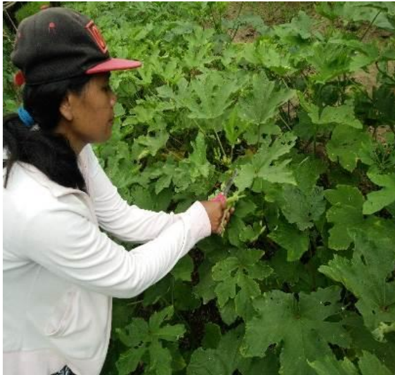
Natural Farming System with savings on use of commercial pesticides and fertilisers