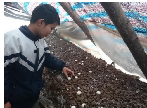
Mushroom planting at a beneficiary's home