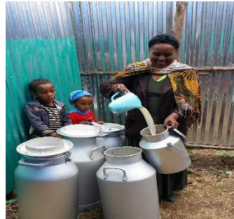
Successful onion field by a farmer collective! (left); Milk producers selling milk for the first time (right)