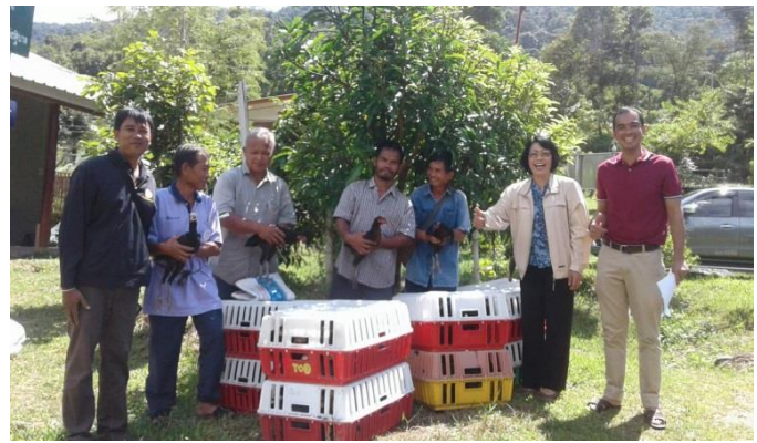
Families and the chickens that they were supported with