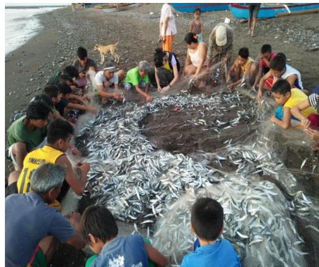
Harvesting more fish