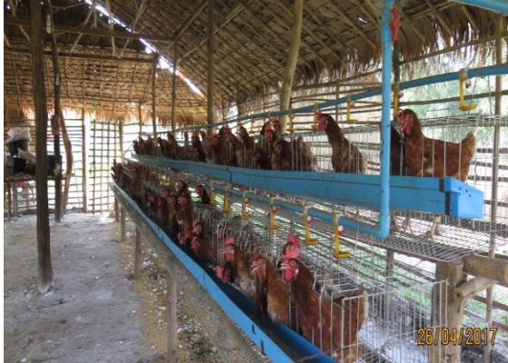
Example of an animal bank of chickens