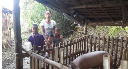
World Vision provided vulnerable households with pigs and feed to diversify their income