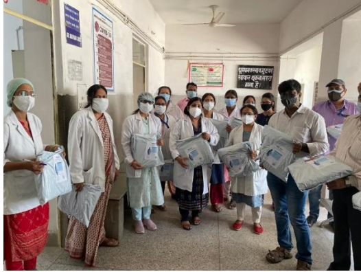
World Vision India distributed over 140 oxygen concentrators and over 950 pulse oximeters to hospitals and health care centres in the states of Rajasthan, Delhi, Tamil Nadu, Uttar Pradesh and Karnataka as part of the COVID-19 response.