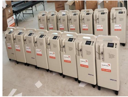
COVID-19 2nd wave Response distribution of O2 concentrators, Mumbai.