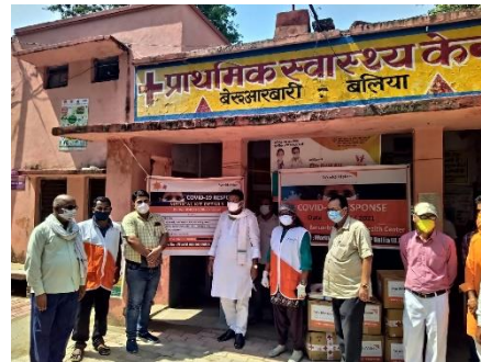
World Vision staff members from Ballia Area Programme (Uttar Pradesh), hand over relief material to the primary health centre.