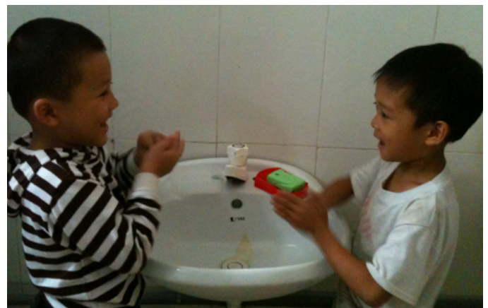
Students have access to improved toilets.

Through all these interventions, World Vision is transforming the lives of children in Tien Lu, making a change today as well as giving them hope for the future!