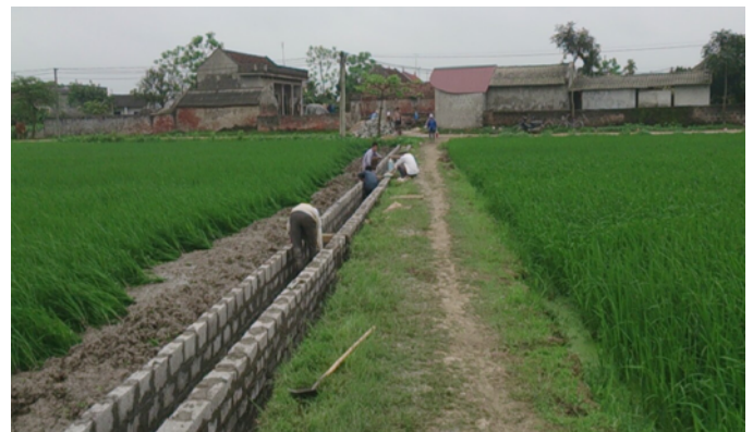
Improved irrigation canals give better yields.

World Vision monitors the health and nutrition of children at home and supports parents with monthly education sessions to increase their capacity to provide proper health care for their children. Cooking demonstrations and deworming campaigns are also conducted to improve the health of children under five. Training in areas like breastfeeding for mothers and nutrition and disease prevention for local health workers are also provided.