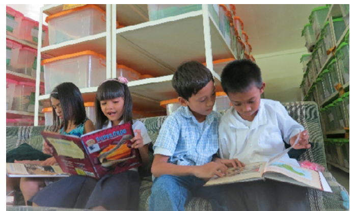
Children enjoy reading supplementary books that World Vision provided.

Teachers are provided with opportunities to enhance their skills in using alternative teaching methods. School facilities are also improved to enhance the quality of education and motivate and sustain children's interest to perform well and stay in school. Learning facilities provided by World Vision include classrooms, laboratory equipment, books and other school materials.