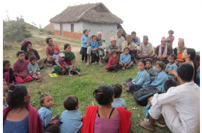
Awareness sessions are conducted to empower the community.

Through all these interventions, World Vision is transforming the lives of children in Sindhuli, making a change today as well as giving them hope for the future!