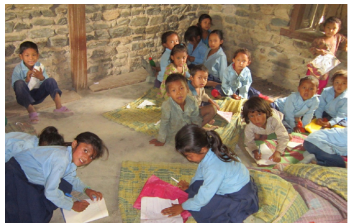
With better learning environments, children learn more in school.