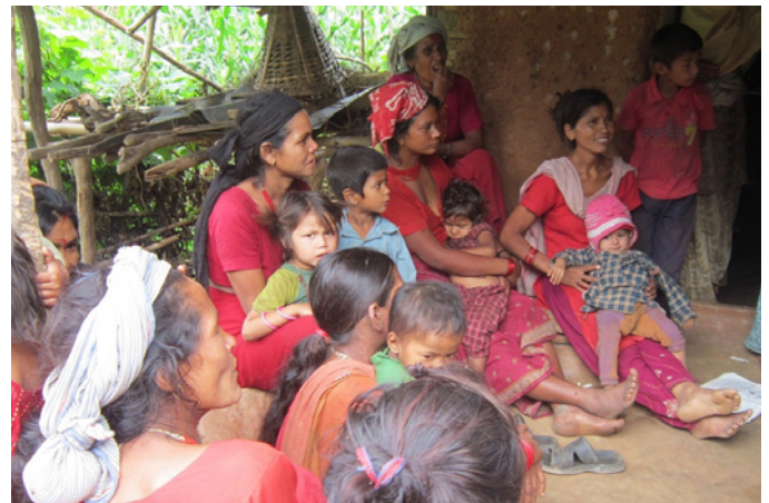
Mothers are educated about the importance of child nutrition.