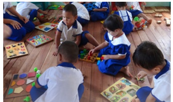
Children learn through ECCD services.

Children and youth groups are formed to include the most vulnerable boys and girls. Community-based responses to child rights violations are also supported such as assisting the Township Child Rights Committees to develop and implement child protection action plans and conduct regular follow up meetings. Training on parenting skills is also conducted for parents and caregivers in target communities. In addition, awareness raising tools on child rights and protection are also developed and disseminated.