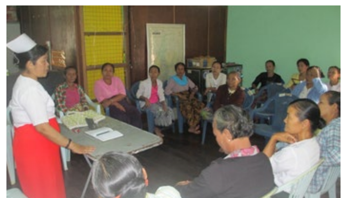
Health officials conduct training to improve maternal healthcare.