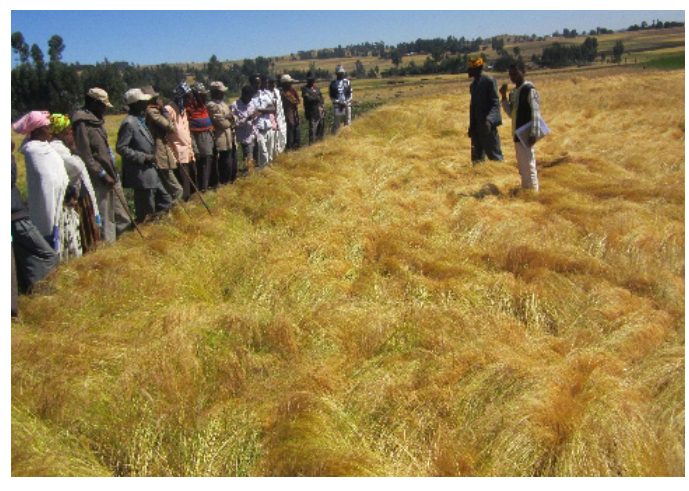
World Vision assists farmers by providing training and good quality seeds to increase agricultural production.

Thank you for your heart for the poor, and for making a difference in the lives of children and families in Ethiopia.