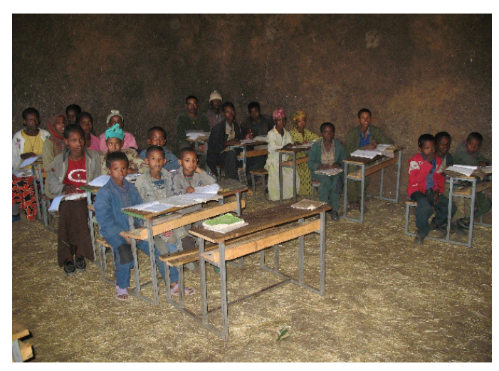
Classrooms now have chairs and desks for students to write on.