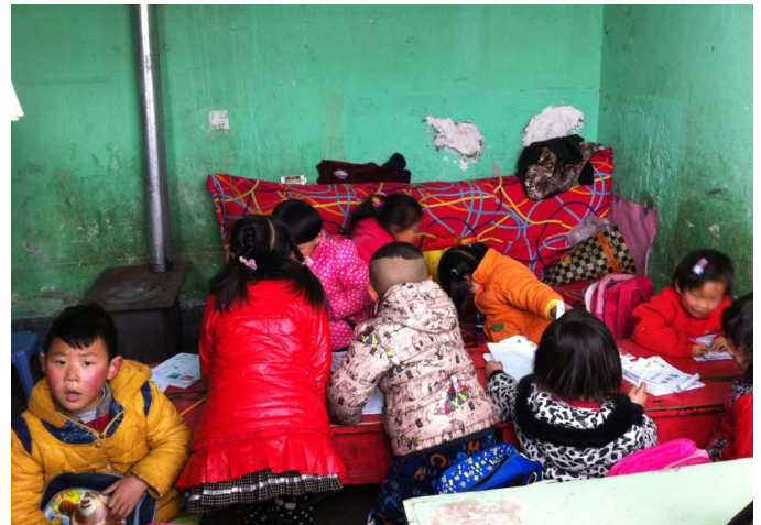
Children have insufficient educational materials and learning spaces.

World Vision proactively facilitates the formation of community groups. These groups receive training to enhance their capacity to address community needs. We also build consensus with local partners and train them on child well-being issues and appropriate actions to take. Together, community members and local partners are mobilised to monitor the health, education and development of children in the community. This is done with the ultimate goal of empowering locals to lead community transformation.