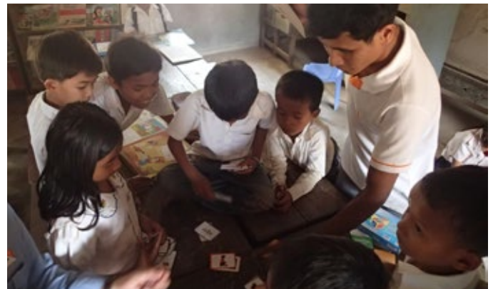
Primary school students improve literacy skills with the help of a literacy coach and interactive games.

World Vision provides training to strengthen the knowledge and practices of mothers and caregivers to feed children more nutritious food. Pregnant and post-natal mothers also receive home counselling and education on holistic care and safe childbirth. To facilitate greater community involvement in improving healthcare, Mother Support Groups help in the distribution of health supplements to children. Health centre facilities and equipment are also provided to improve the standard of health care.