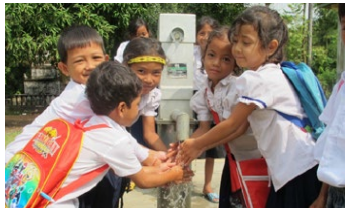
Children have access to clean water with the provision of deep tube wells.

Through all these interventions, World Vision is transforming the lives of children in Kirivong, making a change today as well as giving them hope for the future!