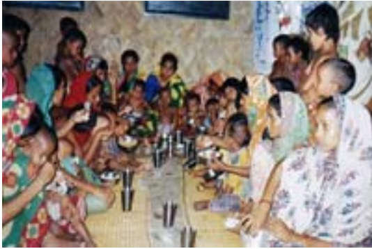
Mothers and children taking nutritional supplementary food