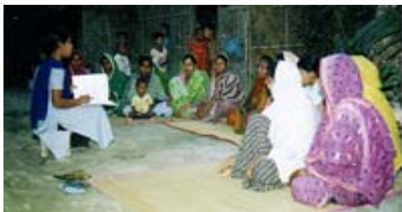
Education for illiterate women in the community