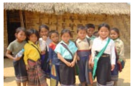
Children in front of their school building

While the target population is mainly involved in subsistence agriculture, the area offers considerable opportunities for alternative livelihood options and economic development, especially cash crops such as mulberry trees, vegetables, fruit and local handicrafts.