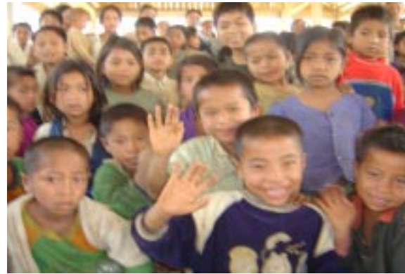
Children in Laos

provincial authorities who welcome technical and financial assistance from NGOs and international organisations for poverty alleviation and long-term development in this district.