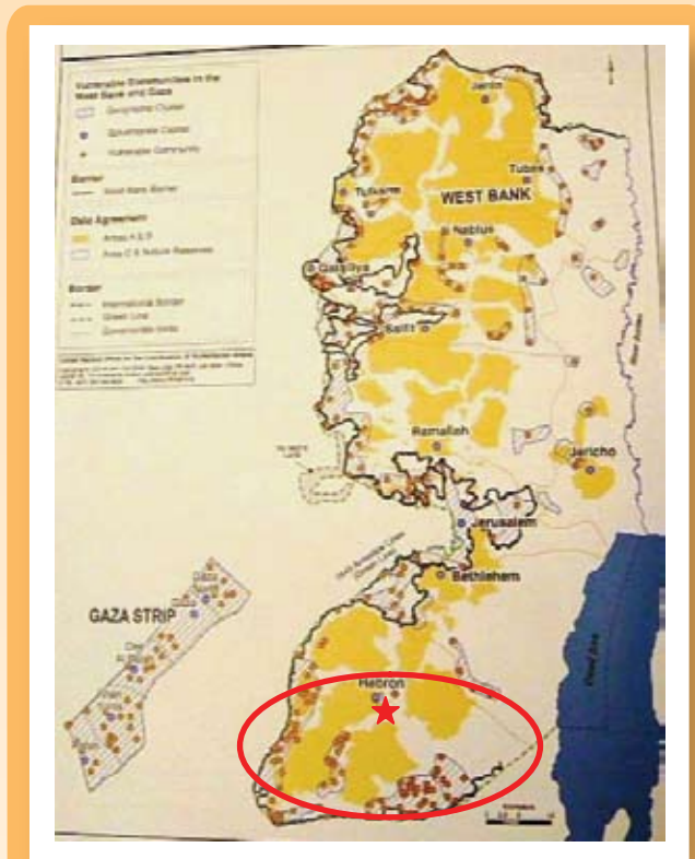
★ South Hebron Area includes the most vulnerable

The overall goal of South Hebron ADP is to enhance livelihood security at the household level through various integrated development interventions.