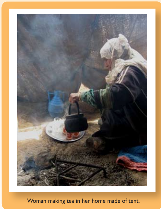
Woman making tea in her home made of tent.

Thank you for walking this journey of faith and transformation with the children, families and World Vision!