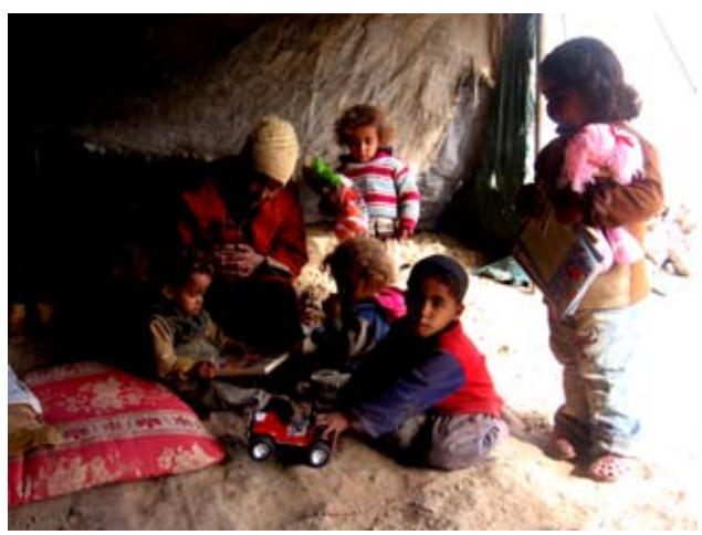
Mother and her five children living with all they have in a tent.

Basic services and infrastructure are severely lacking in the West Bank and Gaza Strip. Hebron, the largest city in the West Bank in terms of size and population, was identified as one of the poorest governorates, with the worst water supply situation. Communities are vulnerable to water-related diseases as sewage and sanitation infrastructure is largely not available. Healthcare facilities in most villages are almost non-existent.